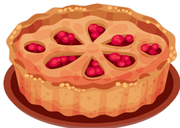
Pyne Farms Cherry Pie $40