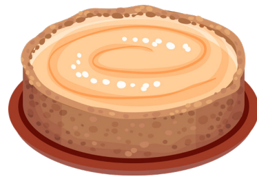
Pumpkin Cheesecake $40

Call 435-800-2870 to order yours today before they sell out!